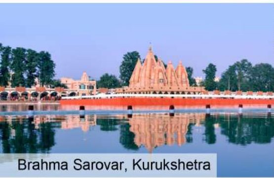
Brahma Sarovar, Kurukshetra