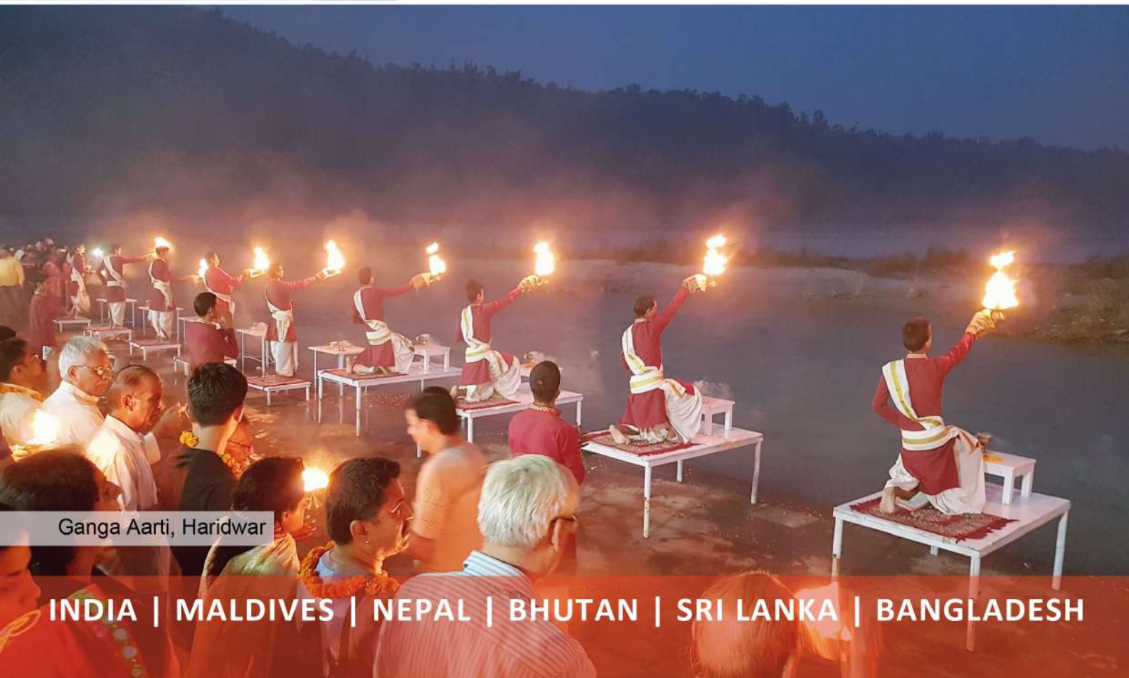
Ganga Aarti, Haridwar

INDIA | MALDIVES | NEPAL | BHUTAN | SRI LANKA | BANGLADESH