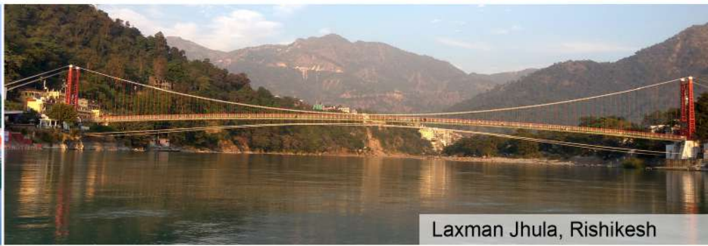
Laxman Jhula, Rishikesh